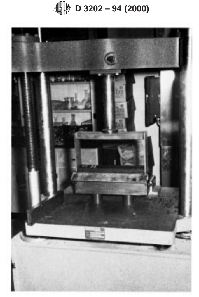
FIG. 2 Beam Extraction Assembly

ASTM International takes no position respecting the validity of any patent rights asserted in connection with any item mentioned in this standard. Users of this standard are expressly advised that determination of the validity of any such patent rights, and the risk of infringement of such rights, are entirely their own responsibility.